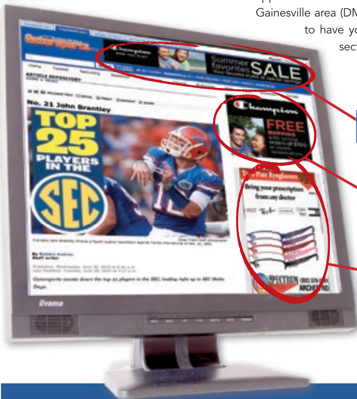
Leaderboard 728x90 pixels

Get great rates when you pay per impression on Gatorsports.com! You can be sure you are reaching local fans too, when you opt for your ads to only appear for those logging on from the greater Gainesville area (DMA Targeting). You can also opt to have your ad appear only in selected sections of Gatorsports.com.